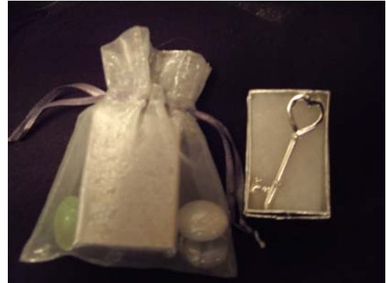
Valentines Day —Ladies Gift (Gala)

We have these beautifully wrapped ladies gifts left from the Gala last week, and are offering them to our members for $50 each. We'll have them available at the February 11 lunch. They are on a first-come, first serve basis. If you would like one mailed to you, please email wandab123@comcast.net